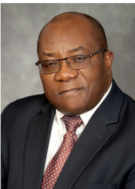
Okechukwu Ugweje Engineering